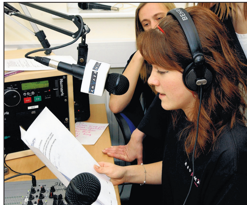
L04457H7 and L04458H7